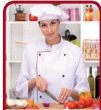
c. Jen is a chef . She can cook meals.