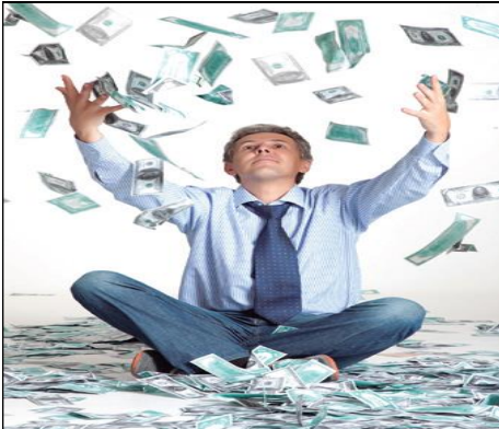
a. Having a good salary.