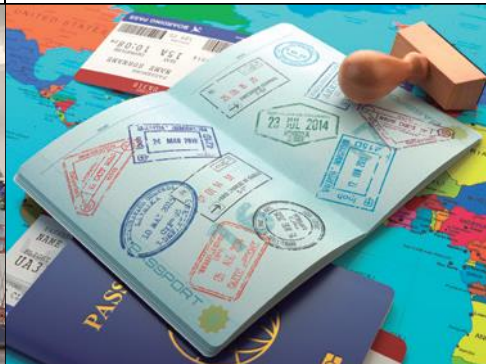
e. Traveling around the world