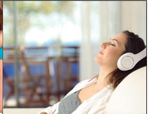
c. Having lots of free time.