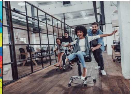
f. Having fun.