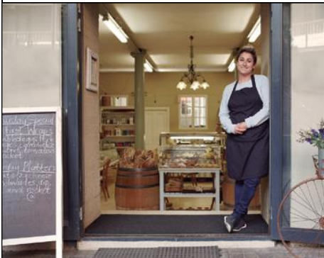
d. Being my own boss.